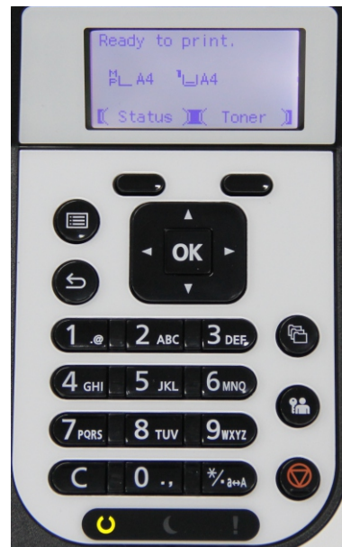
Panel Display 4

Step 4. After press "OK" key, please wait about 5 seconds. Later when the panel shows "Ready to print.", the toner cartridge is ready to be used.