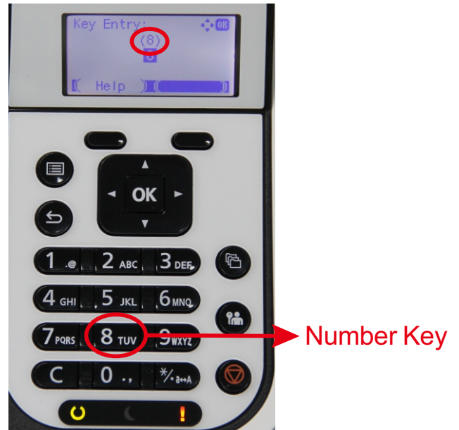
Panel Display 2

Step 2. When the panel shows a random number, please press the same number key (For example, if the panel shows "5", please press "5" key; when it shows "8", please press "8" key.)