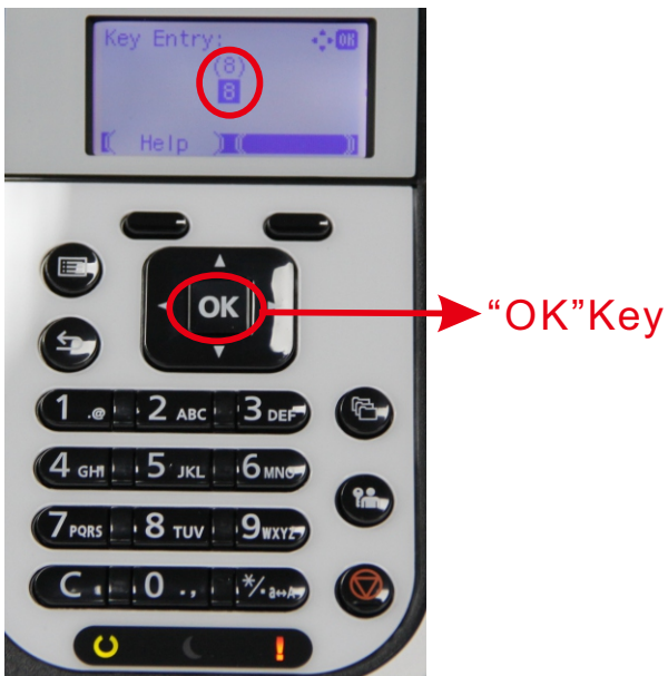
Panel Display 3

Step 3. When the panel shows two same numbers, please press "OK" key.